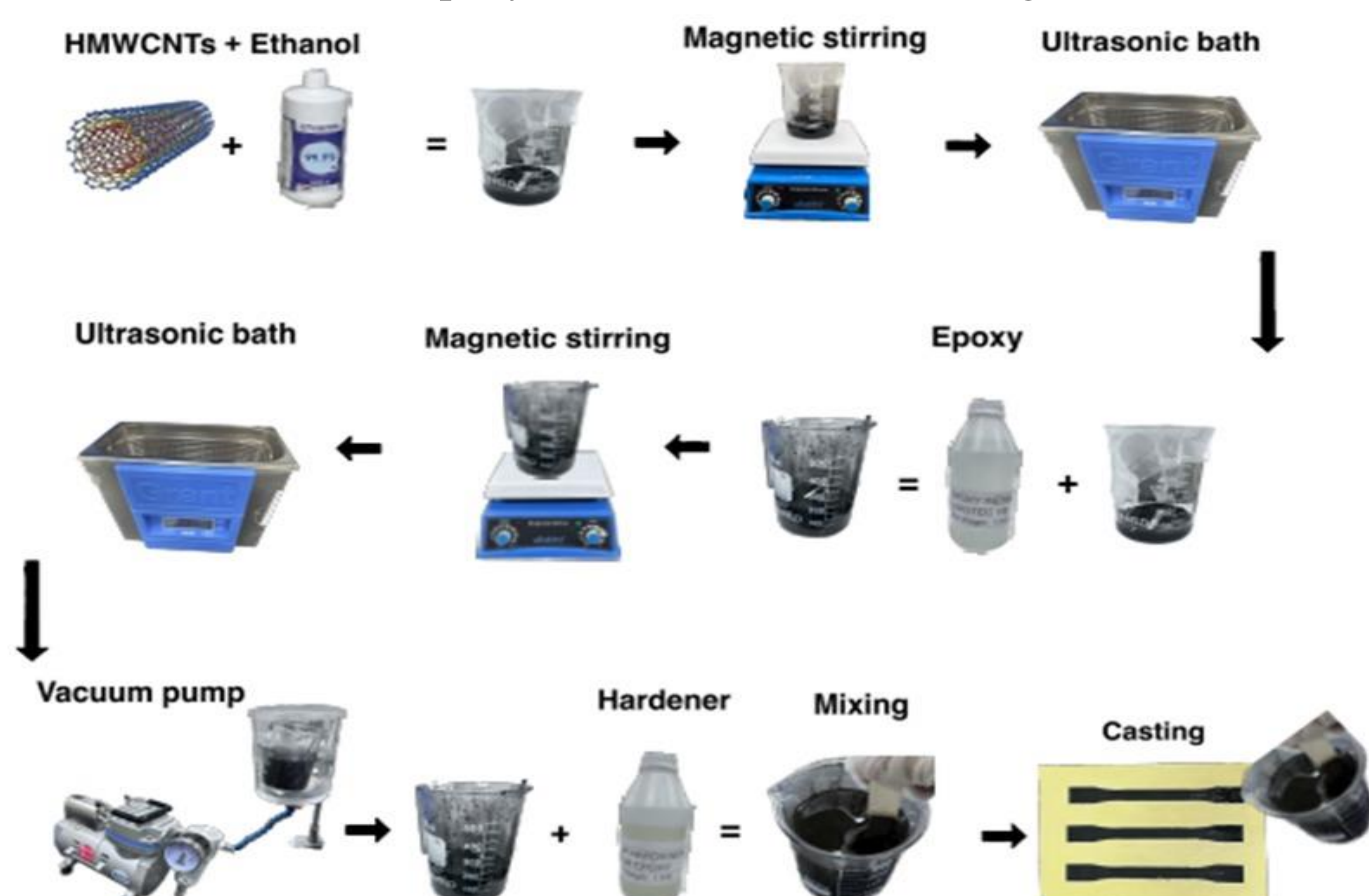
Figure 1. Steps of HMWCNTs/epoxy nanocomposites fabrication

Figure 1 show the steps we followed for the fabrication of HMWCNT/polymer nanocomposite. Also Figure 2 show the equipment at PSAU and SABIC company labs for mechanical testing .